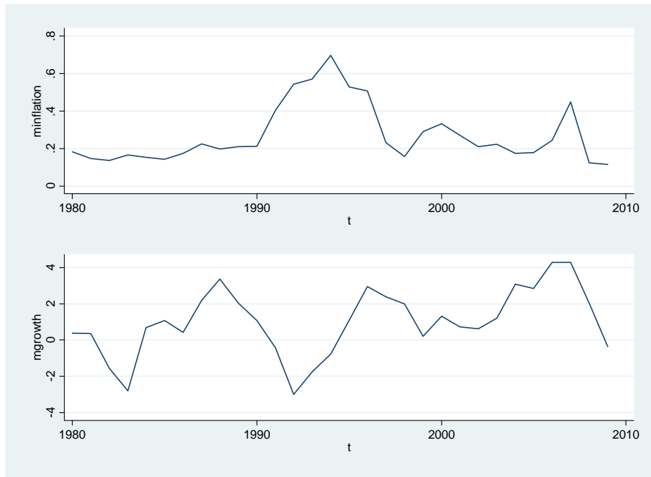
Figure 1: Inflation and GDP per capita growth rates, SADC, 1980-2009. Sources: World Bank and IMF.

To illustrate, in Figure One we plot the averaged-data on inflation rates and GDP per capita growth rates in all fifteen countries in our sample, and what we can see is that the 1980s saw stable inflation and some economic growth. Moreover, in the 1990s inflation saw a considerable increase which was matched by a decrease in growth rates 3 . Coincidentally enough, growth rates became positive again once inflation was brought under control towards the end of the 1990s.