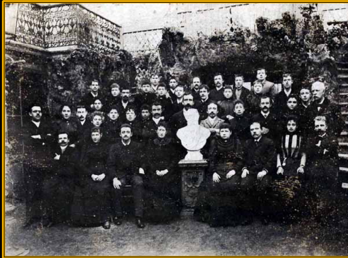
De Beukelaer's Fabrieken play society