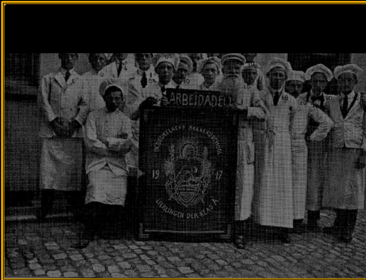
Second Year of the Bakery-School