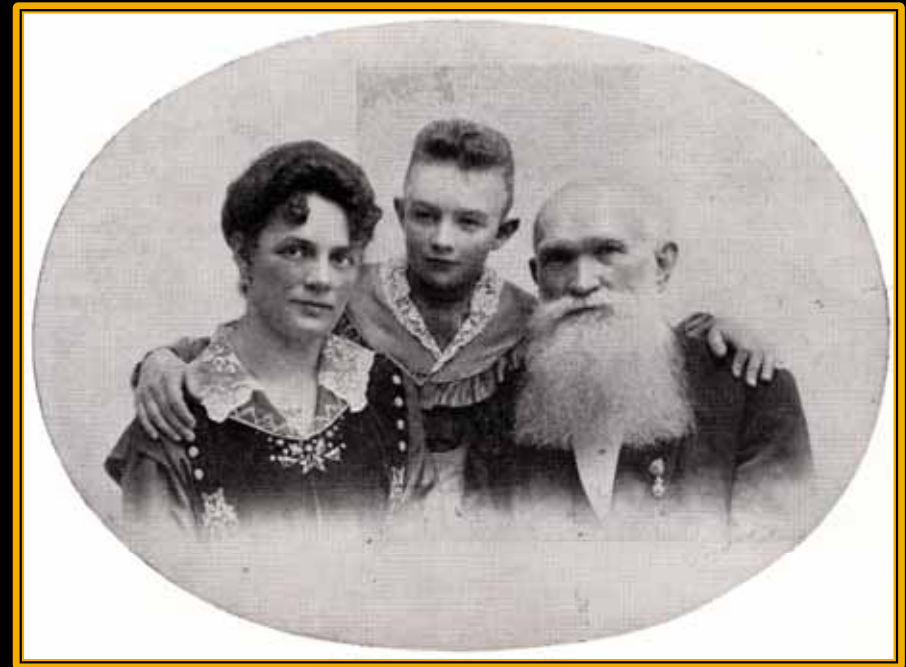
The three generations that lead the company