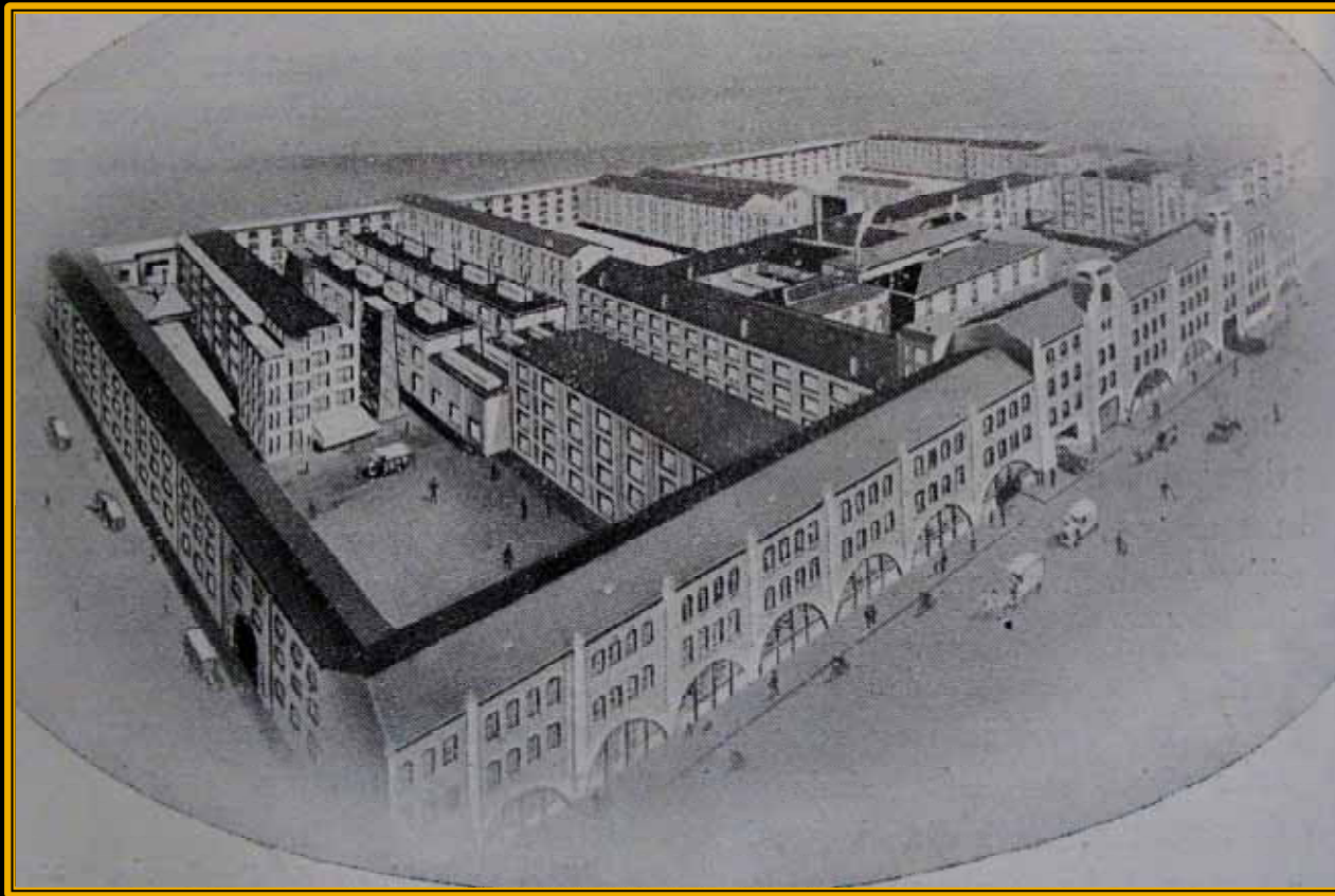
De Beukelaer's Fabrieken in 1929