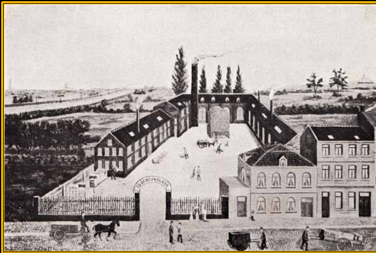
De Beukelaer's Fabrieken during the later part of the 1870's