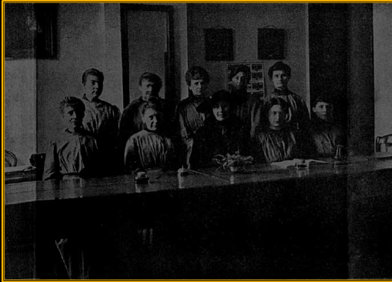
"Social Action" female division